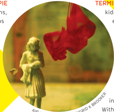
AIR AND KILOMETRES, INGRID K BROOKER

TERMINAL is a projection window that rips up retail, kidnapping the consumer gaze for a journey into elsewhere as part of the '2042: art on the street' exhibition on King Street, Newtown. Terminal features the stunning animation work of Ingrid K Brooker - an artist, animator and multimedia creator from Melbourne. Specialising in stop motion animation, Ingrid's films are assembled from an eclectic mix of found objects and sculpted creations which transport the viewer into bizarre and wonderful worlds of imagination. With themes ranging from the merry to the macabre, Ingrid's films never fail to bemuse, perplex and intrigue audiences. To find out more go to agastopia.com